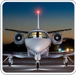
Cessna Citation XLS+

Our Citation XLS+ is the latest version of the world's most popular business jet. It delivers exceptional performance and combines the cabin comfort of a midsize jet with the flexibility and freedom of a light jet.